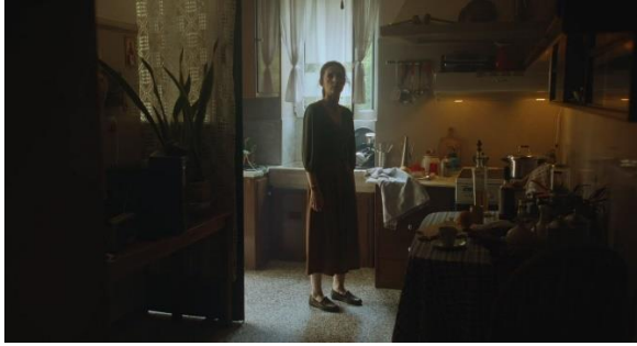
Buffer Zone by Savvas Stavrou - Special Jury Award