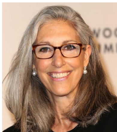
Professor Deborah Nadoolman Landis

Working alongside each other, John Landis and Professor Deborah Nadoolman Landis directed and costume-designed many classic, iconic films such as ANIMAL HOUSE, THE BLUES BROTHERS, AN AMERICAN WEREWOLF IN LONDON, TRADING PLACES, THREE AMIGOS! and COMING TO AMERICA ; for which Nadoolman Landis was Oscar-nominated. Their groundbreaking music video, MICHAEL JACKSON'S THRILLER , elevated the genre as we had never seen before, and continues to resonate with audiences.