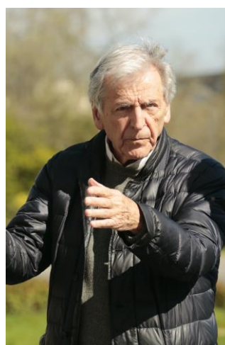
Oliver Stone, Costa-Gavras

(LOS ANGELES, CA - April 25, 2025) The Academy-award winning filmmaker Oliver Stone will join Costa-Gavras on May 31, 2025, at the UCLA James Bridges Theater for an extended conversation following the West Coast Premiere of the newest Gavras film, LAST BREATH .